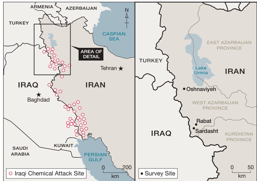
Figure 1. Iraqi Chemical Attack Sites During the Iran-Iraq War (1980-1988) and Survey Sites

Source for the location of the chemical attacks is Holt World History. 3